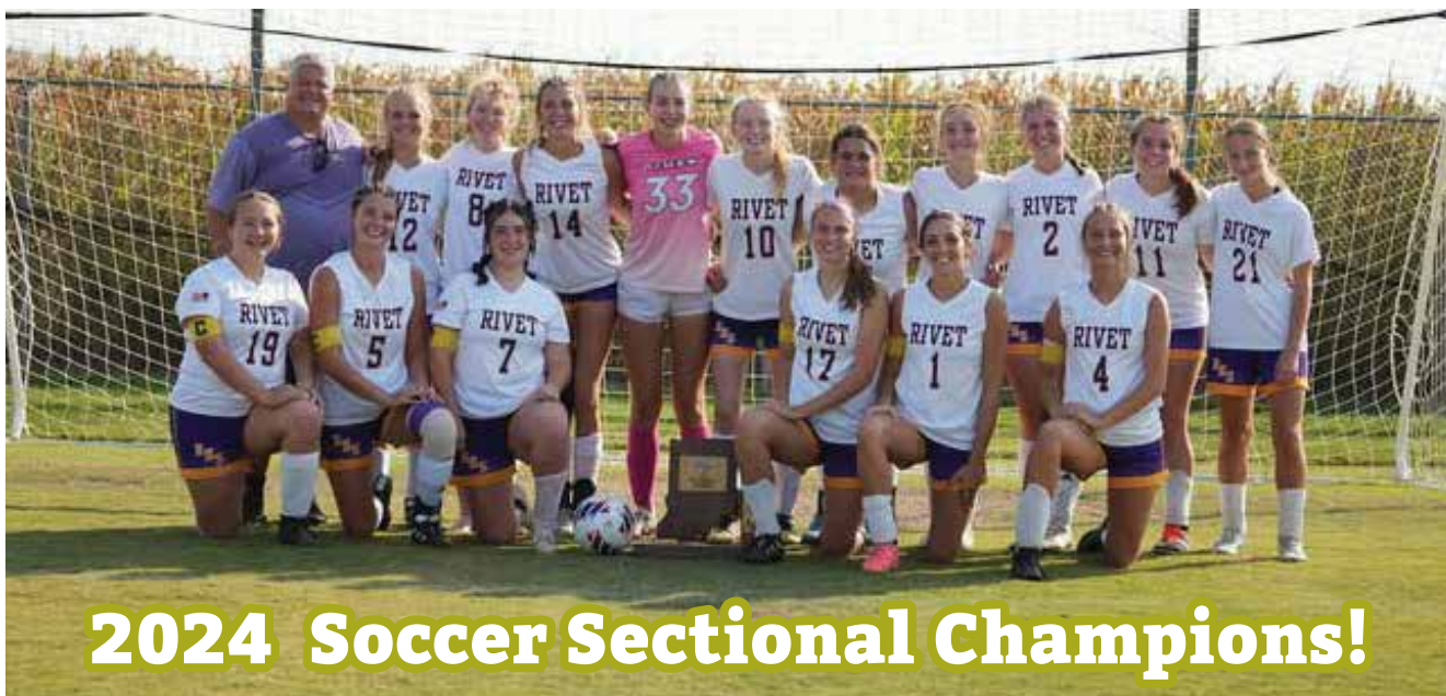
2024 Soccer Sectional Champions!